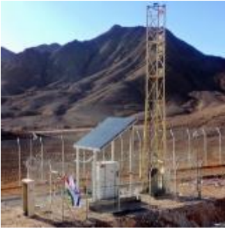
Border protection, intruder detection