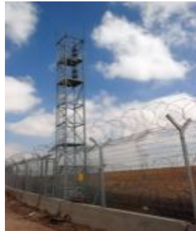
Critical Infrastructure, Strategic site protection